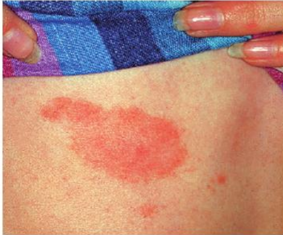
FIGURE 19-4 Allergic rash on the abdomen of a patient in whom orthodontic brackets and archwires were just placed. The patient was tested and was found to be allergic to the nickel in the wires.