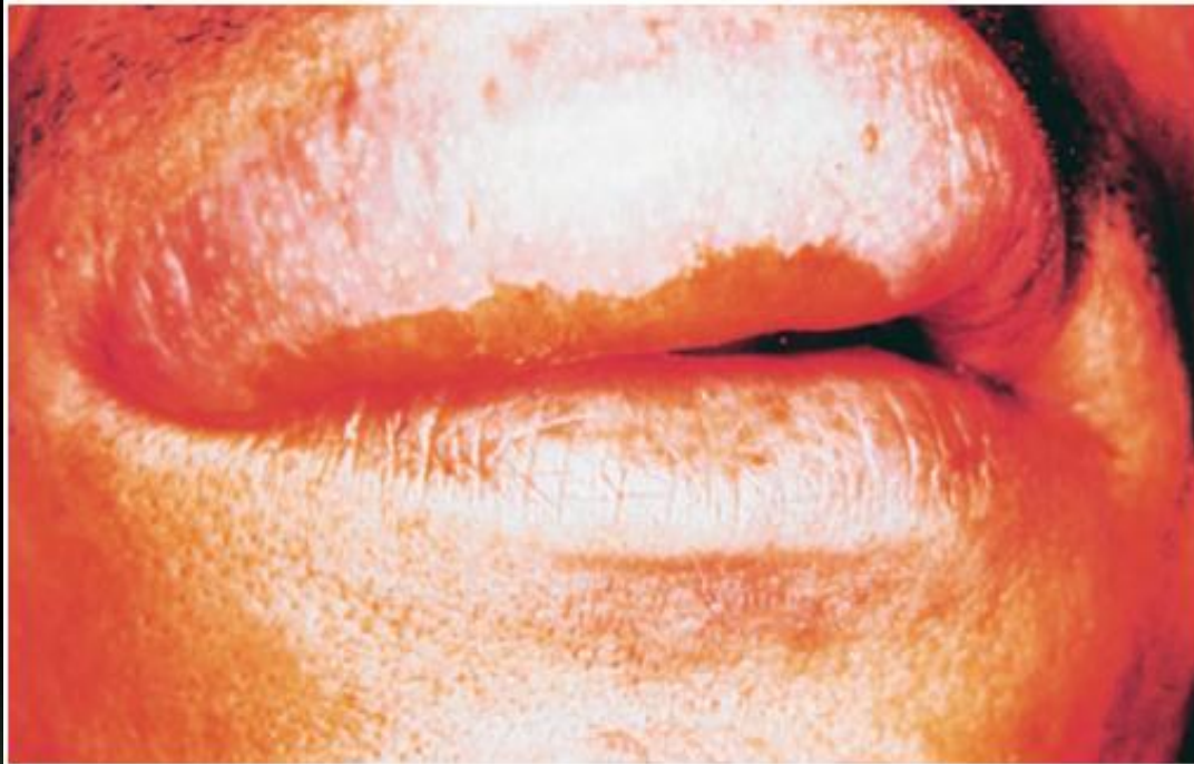
FIGURE 19-2 Angioedema of the upper lip that occurred soon after injection of a local anesthetic.